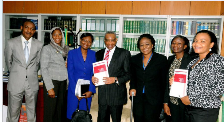
Hon. Justice Dahiru Musdapher in the middle, with his staff and the UNODC team