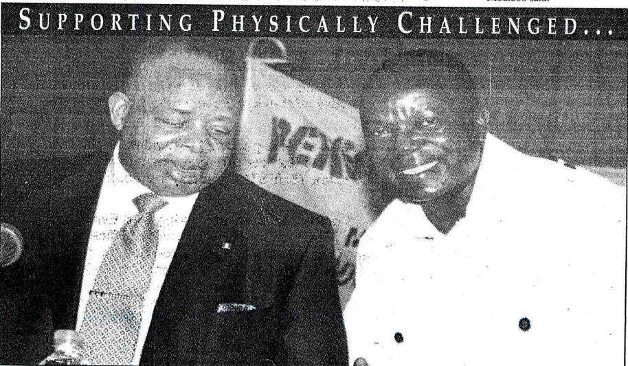
•Former Senate President, Senator Ken Nnamani (left) and Trustee Chairman, Joint National Association of Persons With Disabilities

291, Ikorodu Road, Idiroko Bus Stop, Maryland, Anthony, Lagos.